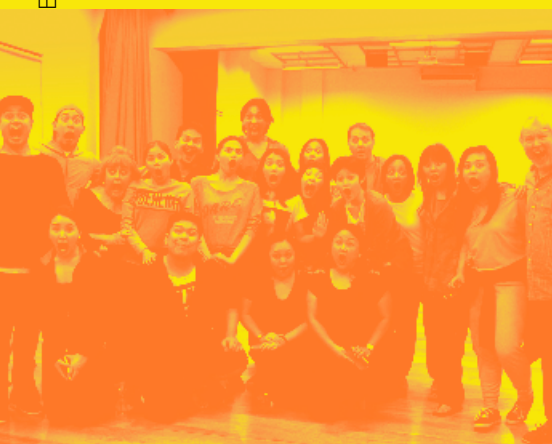
Above: Globe to Globe production of Hamlet, 2015.

The Philippines, an Association of Southeast Asian Nations (ASEAN) member state, is categorised as an emerging power and its relevance to the UK is growing, indicated by two Foreign Secretary visits since 2014. The UK is the largest European investor in the Philippines, and UK exports to the Philippines have increased year on year since 2015.