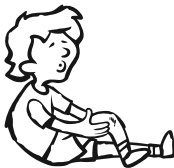
h ur t