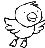
b ir d