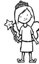
g ir l