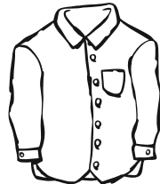
sh ir t